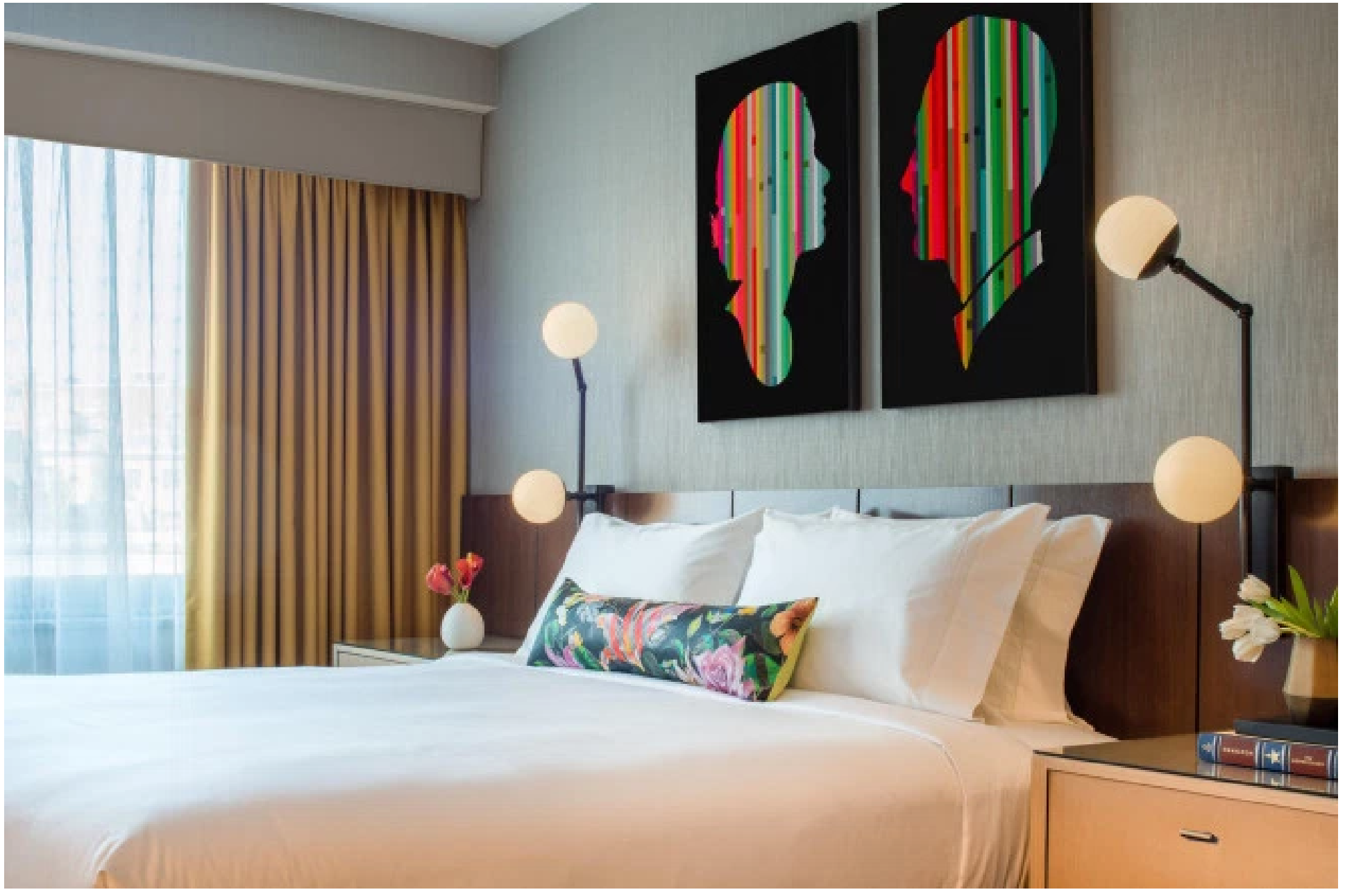
The hotel offers the efficiency of a big chain as well as the hip local nods you'd expect from a boutique spot.